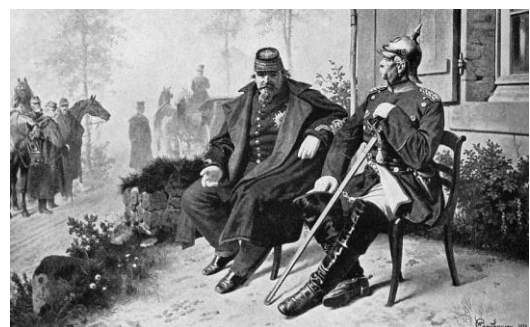
Source F. Napoleon III and Bismarck