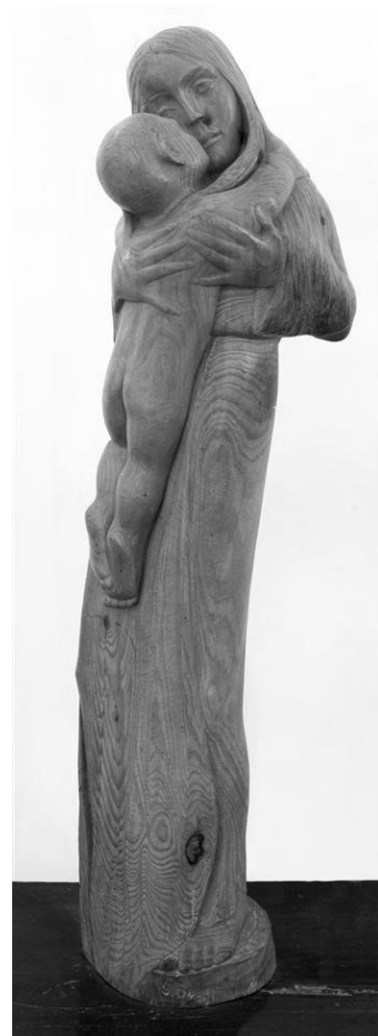
Fig. 1c – Mother and Child – Samuel Bugeja