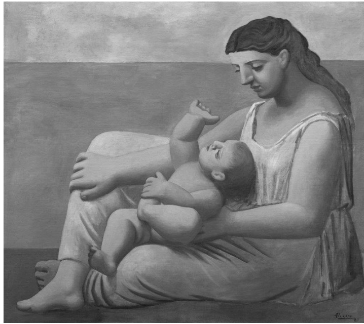
Fig. 1a – Mother and Child – Pablo Picasso