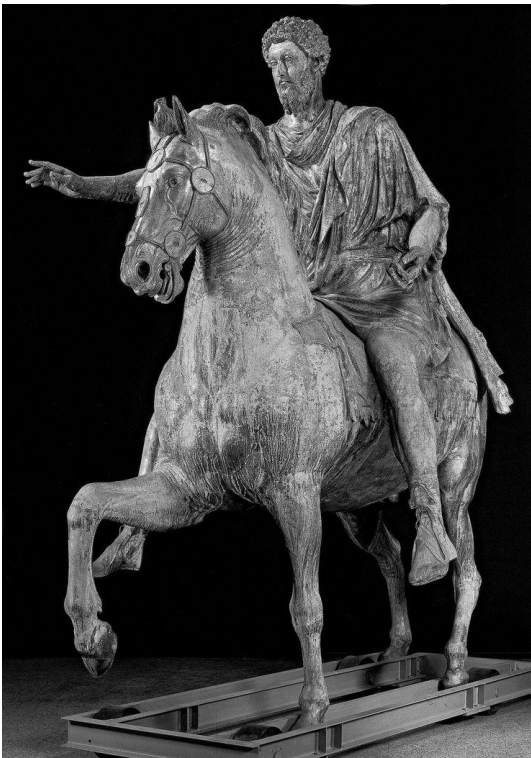
Fig. 3 – Statue of Marcus – Musei Capitolini