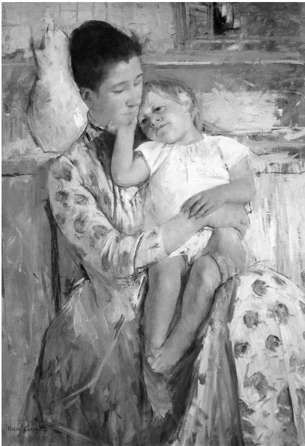
Fig. 1b – Mother and Child – Mary Cassatt